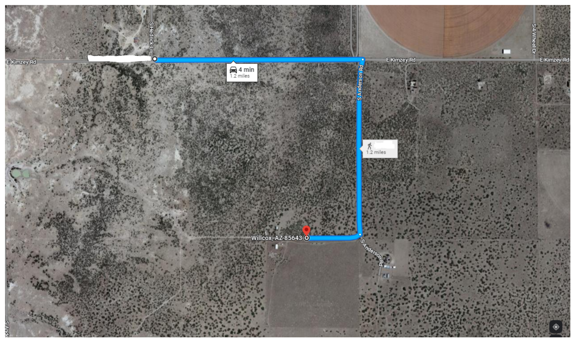
MAP 3. ROUTE TO STOP 2