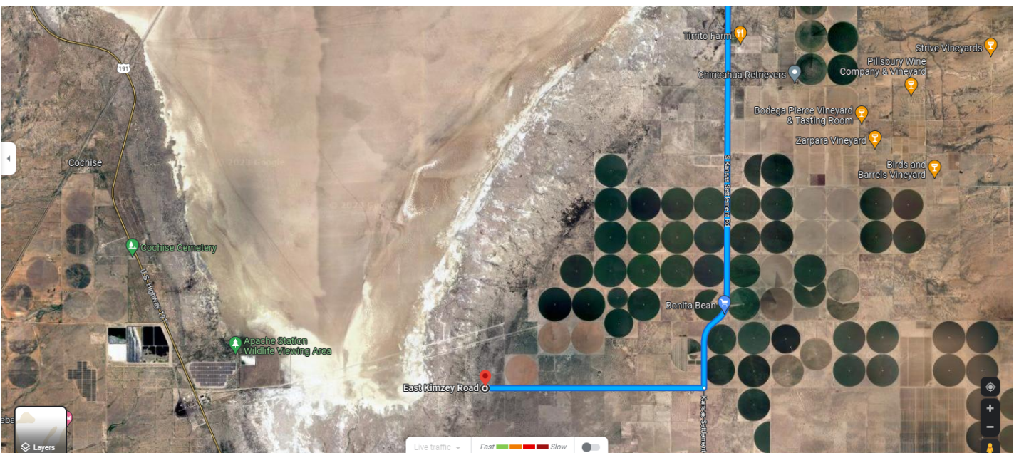
MAP 2. ROUTE TO STOP 1